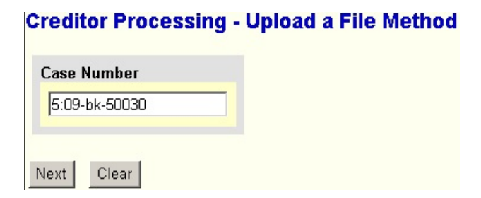
Step 3 - The UPLOAD A FILE METHOD screen displays.

Enter the case number for the appropriate case. Click the [Next] button.